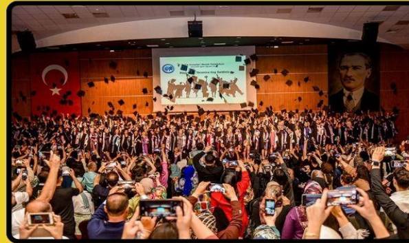
From the 2023-2024 Academic Year Graduation Ceremony