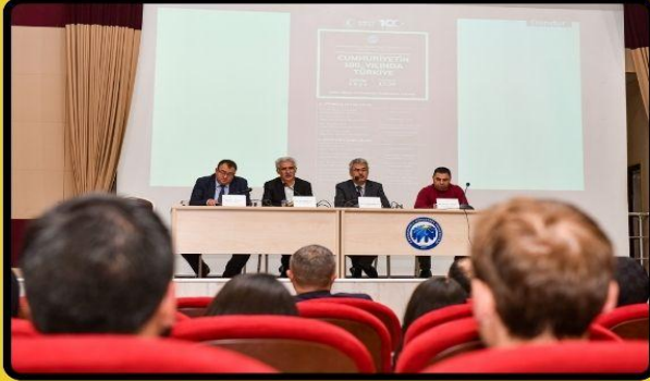
From the scientific event titled “Türkiye in the 100th Year of the Republic”