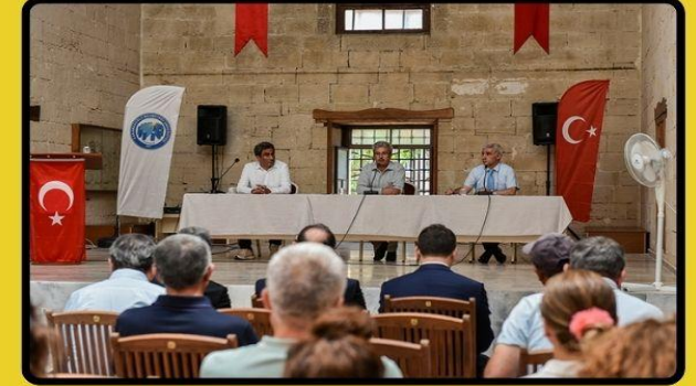
From the panel titled “Coups in Turkish History and July 15”