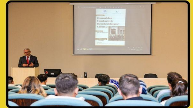
From the conference titled “Our Efforts for Democratization from the Ottoman Empire to the Republic”