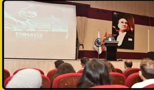
From the conference titled “Ataturk’s Visit to Samsun and the Importance He Gave to Youth”