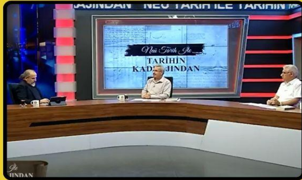
Our department professors who participated in the program called “From the Frame of History”